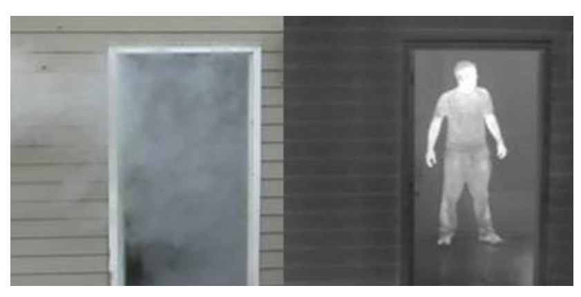
The infra-red radiation can also penetrate through smoke. The thermal cameras enable to detect people through smoke or fog.

The question is how to proceed if this does not concern the protection of an exactly specified area (parking place or entrance to a building), i.e. in cases where it is not possible to use a securely installed (stationary) thermal camera to monitor the designated area. The solution is the application of mobile systems. For monitoring small areas or searching for people in areas where anyone can walk within a restricted time, there are many types of handy thermal cameras available on the market. Although how do you proceed when the exact size of the monitored area is unknown or difficult to access?