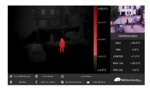
A manually adjustable thermal alarm (interval, above or below) helps when localizing missing persons or intruders. They can be easily identified during day and night and clearly distinguished from the surroundings.

By correctly setting the reading parameters and using a suitable device, an object with different temperature can be detected within a distance of several kilometres. It should be noted that a potentially dangerous "object" may not just be a living creature and can also be a car or other form of transport or perhaps the centre of fire. It is a high-security risk that poses a risk every day to humans and property. By using infra-red radiation and thermal cameras, safely guarding of objects, people and property becomes easier and more reliable. An observer can view the screen in a safe place and in the case of any threat can, due to the various alarm settings, see with one look if there is a risk. Warm objects are usually highlighted in thermograms by contrasting colours - the surrounding may be a shade of grey and everything with a higher temperature than say 35°C is displayed in red. It is then quite obvious of where and what are the risks and quick action can be taken.