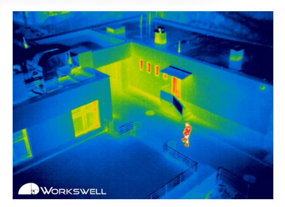
This image was produced at night. The intruder approaches the guarded object and was discovered in time due to the night vision provided by thermal cameras.

Without the option to manually set the temperature range, there is a large risk of not seeing live objects due to insufficient system sensitivity!